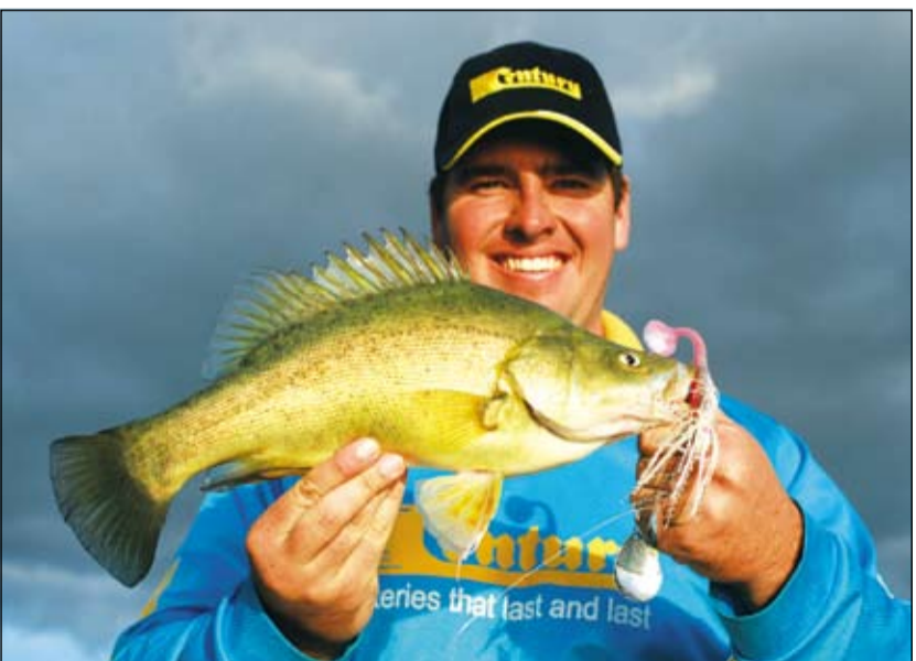
An average sized Chaffey yella taken by Nick on a Priscilla Pink Bassman Codman with big silver blades. When fish are on the chew at the dam, size doesn't always matter.

H OOKS are setting, drags are peeling and once again the waters of Northern NSW are producing anglers with rewarding catches of fish.